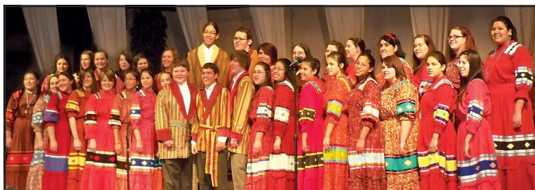
Cherokee Nation Youth Choir

Want to be part of the fun? We still have room for vendors, and volunteers. Just give us a call at 782-5074 and we will be happy to include you in our events. Heritage Festival is a fund-raiser for our summer "Meals For Kids" program. Your support and sponsorships are appreciated.