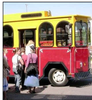
Free Historic Tour