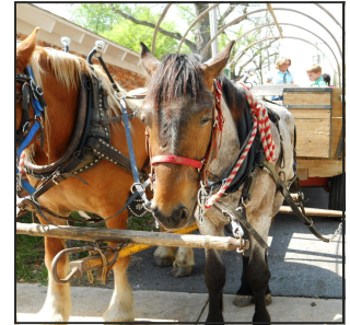
Free Wagon Rides