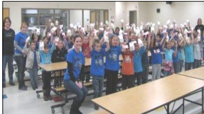
King Elementary Kindergarteners celebrate a job well done with popcorn from Arvest Bank and Goody’s Yogurt coupons.