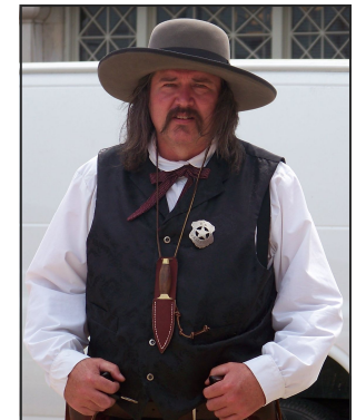
Old West Shoot-outs